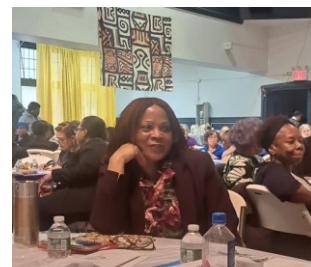
Participants sharing with each other