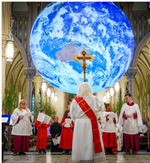
“Fight for Earth” Day 2026

Trivia Night (May 27, 7:00pm) — Bring yourself or register a parish team to compete for a good cause - the Cathedral's outreach ministry, and a few prizes! Hosted by NYC's The Big Quiz Thing this promises to be a fun-filled evening for all.